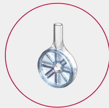
LARGE DOSE DPI