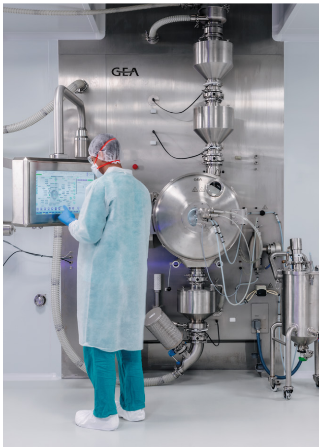
Hovione has installed state-of-the-art Continuous Tableting equipment