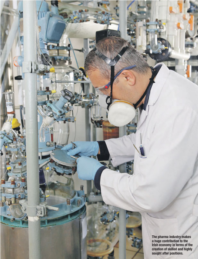
The pharma industry makes a huge contribution to the Irish economy in terms of the creation of skilled and highly sought after positions.

a range of sectors including pharmaceuticals, IT and financial services that are looking to ensure that they have a presence in the European single market."