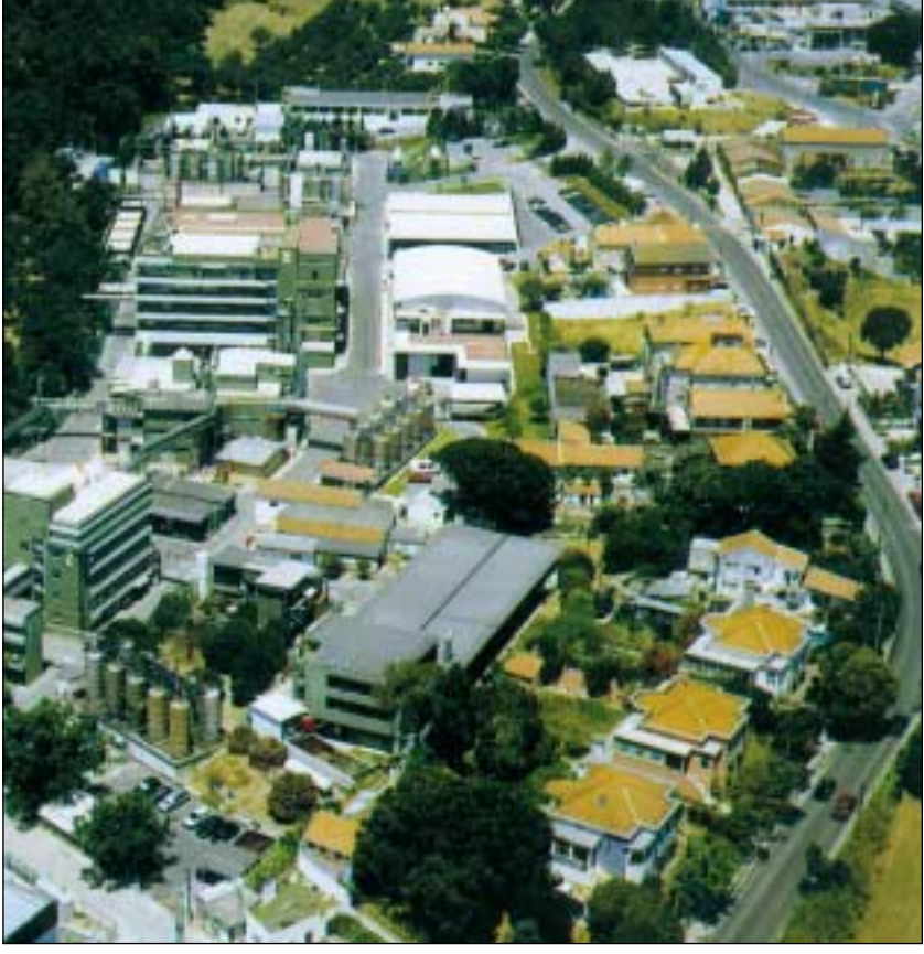
The main Hovione site is on the outskirts of Loures

Hovione has become a global player, with facilities on three continents and sales patterns to match. Turnover was just over €80 million in 2001, of which 55% was in North America, 25% in Europe, 12% in Japan and 8% elsewhere. World-wide, production capacity is now over