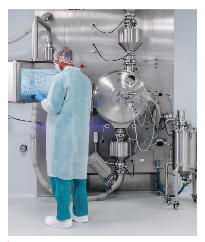
Hovione has installed state-of-the-art Continuous Tableting equipment